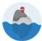
Innovation & Architecture for the Sea

Click on each image to discover the project's video: