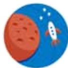
Innovation and Architecture for Space