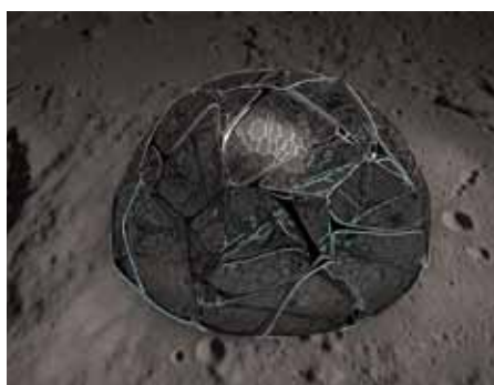
Moon: Origin Point