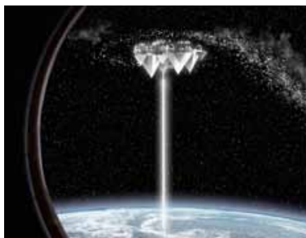
Neck of the Moon