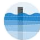
Architecture and Sea Level Rise